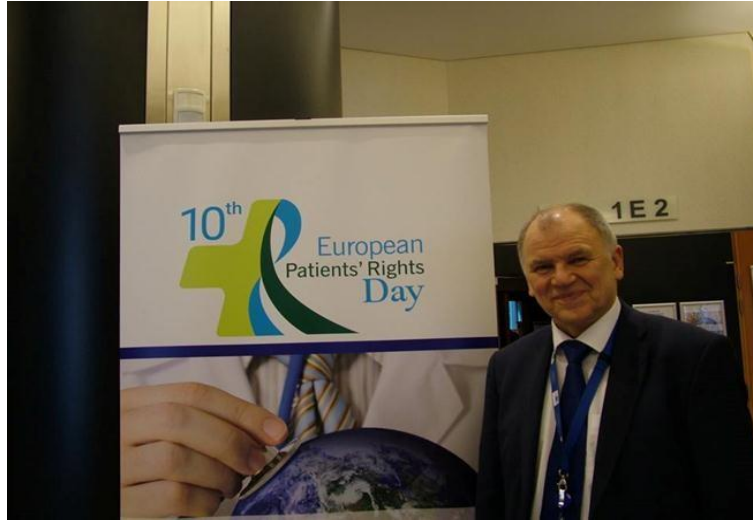
Commissioner for Health and Food Safety Vytenis Andriukaitis